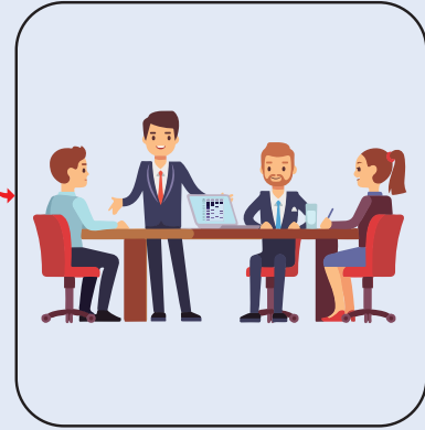
EXPLAINING PCR RESULTS